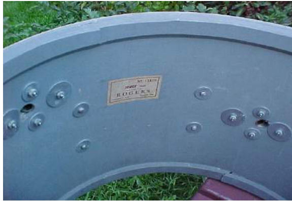
Reinforcement hoops on the top and bottom edges of the drum