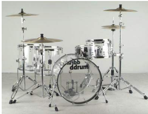
ddrum Acrylic Drum set

Acrylic drums are very noticeable on stage, not just because of the looks but of the sound also, which is brighter, louder and has more of a metallic tone on the lines of a metal snare. Since acrylic is a non porous material, the sound waves produced on the inside when the drum is hit, bounce like crazy, there is no absorption into the acrylic, so you will be getting pure sound from it.