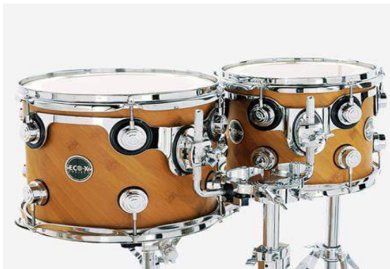
DW Floating Mounts System