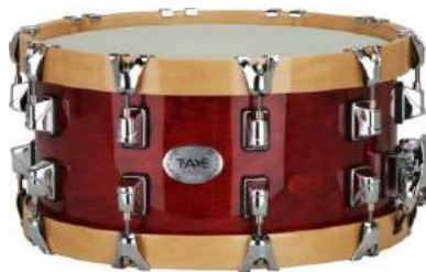
Snare Drum with Wood Hoops

Wood hoops have less of a sharp attack; you are going to have a round kind of warm body to it. It will give you an open tone, not boomy and less metallic. Metallic hoops are louder, have more attack and can project a sharp sound. Also wooden hoops are more expensive.