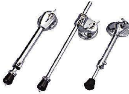
Various types of Spurs