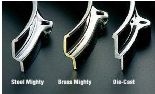
Tama Metal Hoops - The two on the left are triple flanged hoops