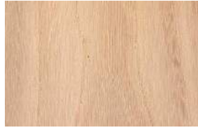
A piece of Beech Wood

Acrylic drums are very noticeable on stage, not just because of the looks but of the sound also, which is brighter, louder and has more of a metallic tone on the lines of a metal snare. Since acrylic is a non porous material, the sound waves produced on the inside when the drum is hit, bounce like crazy, there is no absorption into the acrylic, so you will be getting pure sound from it.