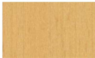
A piece of Maple Wood (Bland color and not a lot of grain figure)

Maple is more of a projection wood. It is going to project your drums louder and you will be getting a lot of volume out of a maple kit, so it is a very good choice for live drumming. Maple has nice controllable qualities for studio recording.