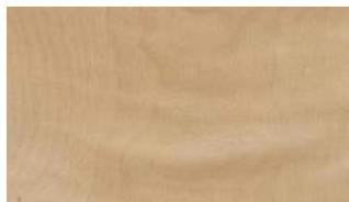
A piece of Birch Wood (bland color just like maple)

Birch is fabulous for recording because of its warmer tone, it is easier to equalize and tune. These drums are like self EQing drums. Birch wood is a very good drum for live performance.