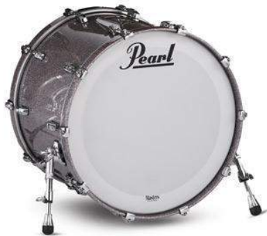
Bass Drum With Spurs

What we have just talked about is one of the reasons why Casey Drums have small lugs, with a single bolt, so this way they have very small contact with the shell.