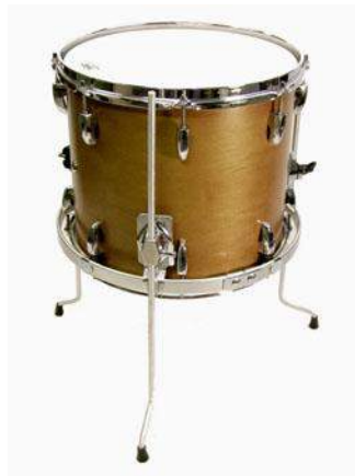
Well Mounted Lugs and Floor Tom Mounts

When buying a drum set, you don't need to necessarily worry about these issues, unless you see drums with lugs that are really far into the drum. You can also check brochures and things like those, to see what companies have to offer, and check possible problems like hardware placement.